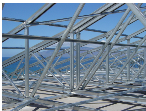
Ka'anapali Ocean Resorts - Maui, HI