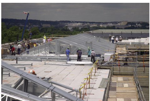
Project Phoenix - Pentagon Rebuild