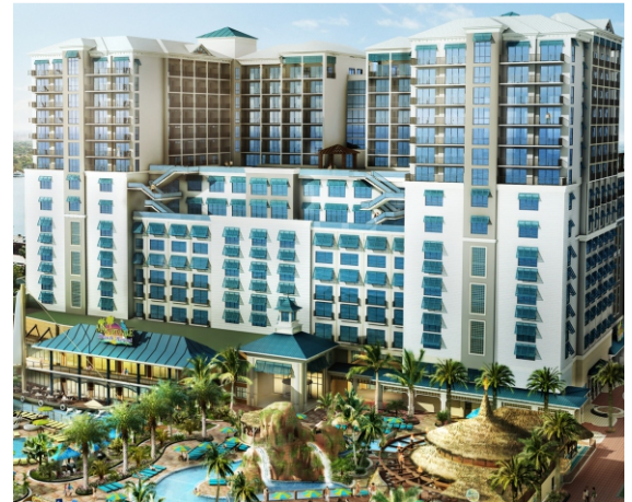
A multitude of roof planes and gables is evident at the Margaritaville Hollywood Beach Resort.

The LandShark's interior ceiling is the perfect inverse of its exterior roof profile. To create the effect, Pagano designed parallel chord trusses, each 2-ft. deep, using the TrusSteel Cold-Formed Steel Truss System. This premier system features Double-Shear™ fastening technology and patented U-shaped profiles that efficiently transfer structural loads. It also reduces the need to install lateral restraints and bracing. At Margaritaville Hollywood Beach Resort, the system met the challenge of supporting a tiki-style roof.