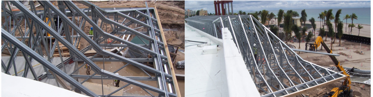
A cantilevered truss design, reflecting the shape of a Polynesian-style roof, incorporates many TrusSteel Cold-Formed Steel Truss System sections.